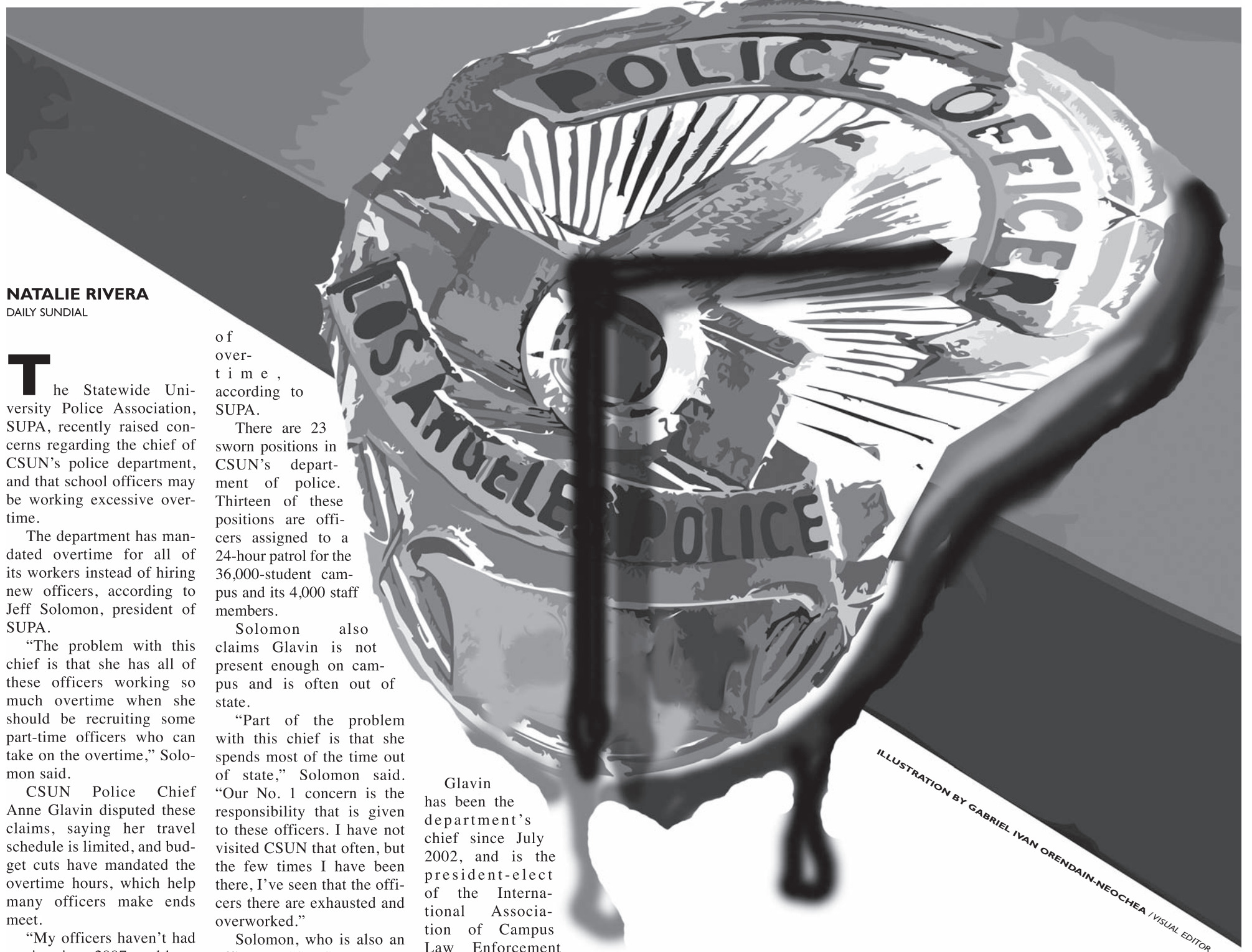
ILLUSTRATION BY GABRIEL IVAN ORENDAIN-NEOCHEA / VISUAL EDITOR