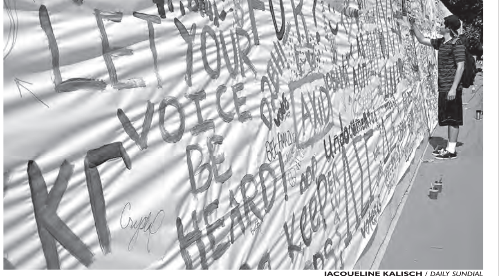
Students gather to display their voice on the freedom of speech wall at We the People event on Oct. 4.

Money from ticket sales to the Big Show will help finance the performance. The changes were approved by a vote of 15 in favor and two abstentions.