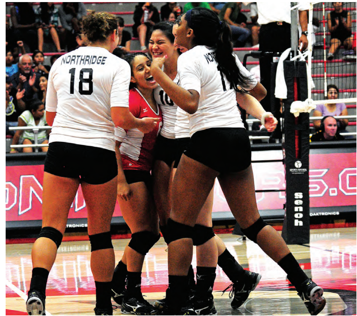
The Matadors celebrate a kill in the Matadome. CSUN had lots to celebrate in a three-set sweep Saturday.

CSUN next travels to the Rainbow State to avenge their conference-opener loss against No. 8 Hawai'i, a team the Matadors nearly defeated in five sets last month.